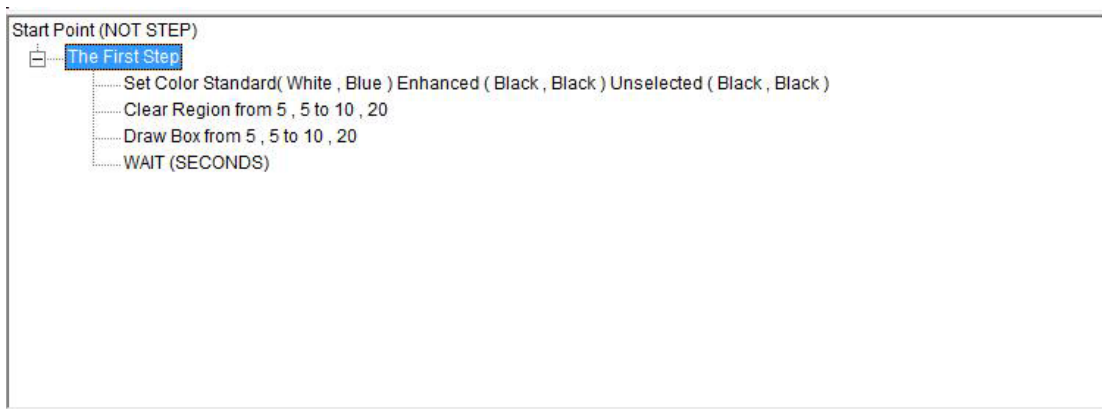
The final steps tree